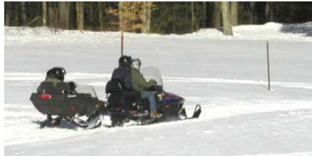
Snowmobile ride at Wendell State Forest