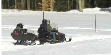
Snowmobile ride at Wendell State Forest